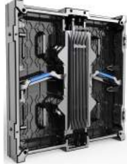
Lightweight aluminum panels