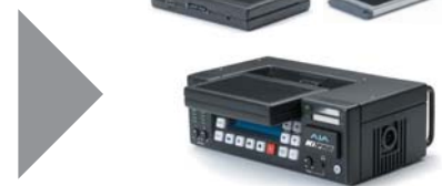
Remove the Storage Module or ExpressCard 34 media from Ki Pro.