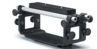
Rod Accessory kit installed on Exo-skeleton

HDMI™ HIGH DEFINITION MULTIMEDIA INTERFACE