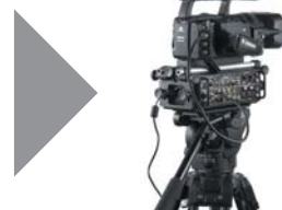
Ki Pro is post-ready production.