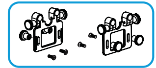
Rod Accessory kit