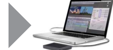
Connect this media to either your Apple MacBook Pro or Apple Mac Pro. Import the footage into Final Cut Pro. Edit. Simple.