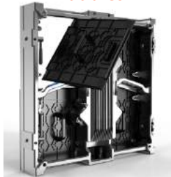
Rear removable modules