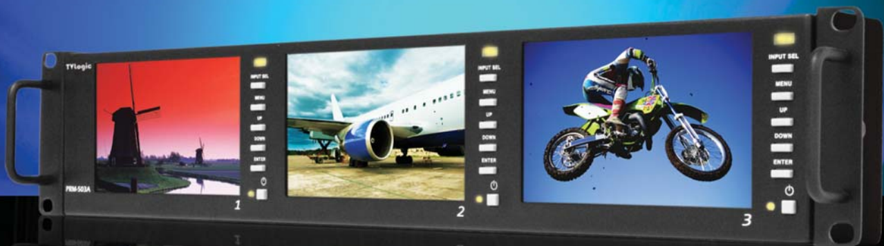
MULTI - FORMAT LCD MONITOR PRM-503A

Three 5" 800x480 LED backlit LCD panels with 90° tilt range are included in the PRM-503A. Input selection and full PRM series feature-set menu is accessed via the front panel.